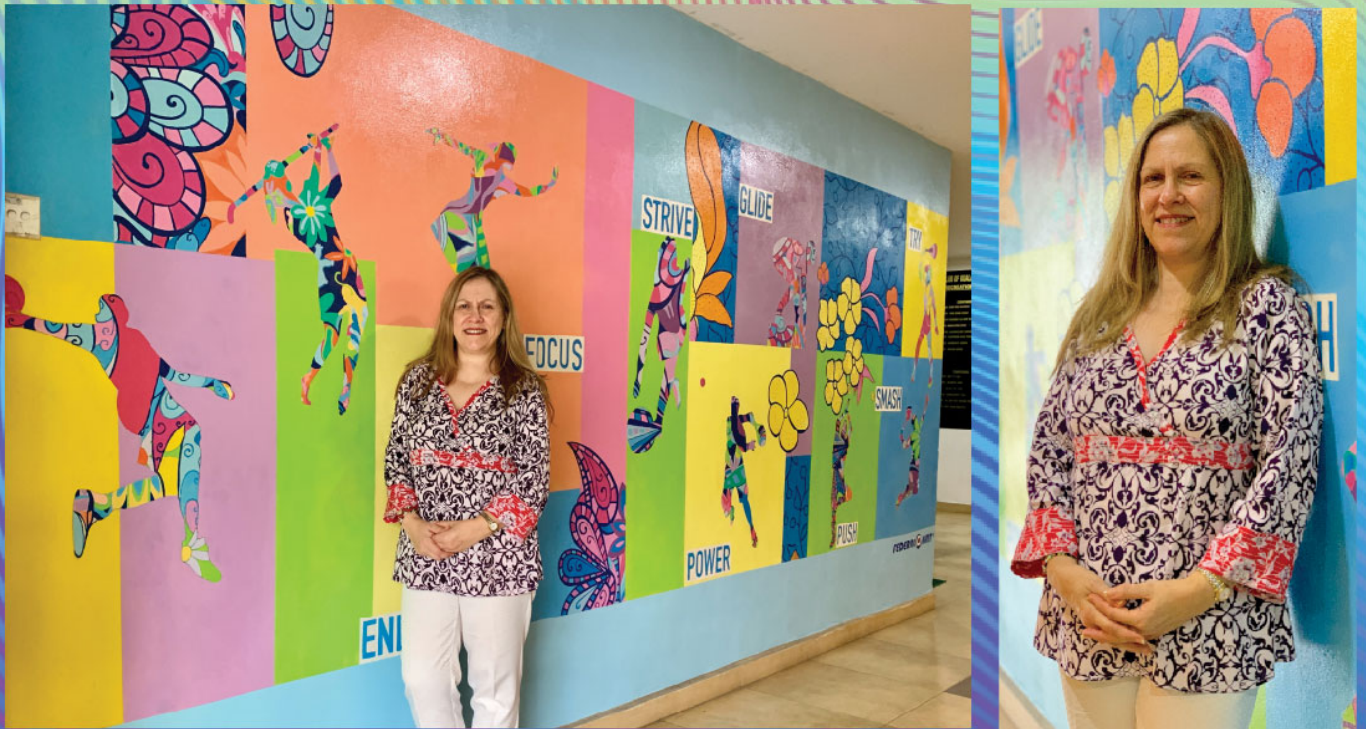
Location : Sports Pavillion Walkway