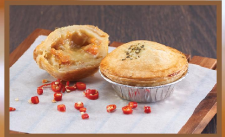
Thai Green Curry Pie RM 6.50