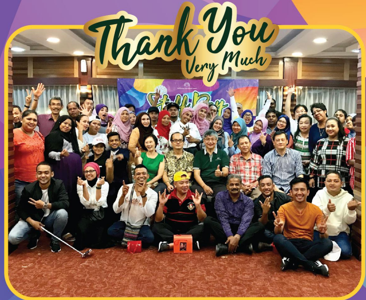
TABLE TENNIS FRIENDLY WITH PALEMBANG TEAM 10 MAY 2018