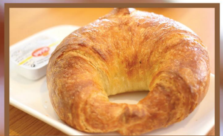
Butter Gipfel Close RM 3.50