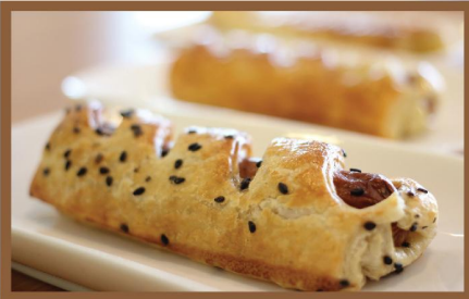
Firecracker Sausage RM 3.50