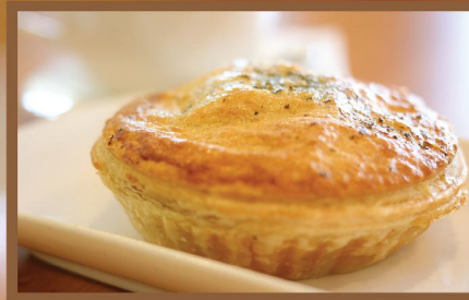
Black Pepper Chicken Pie RM 6.50