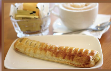
Banana Puff RM 3.50