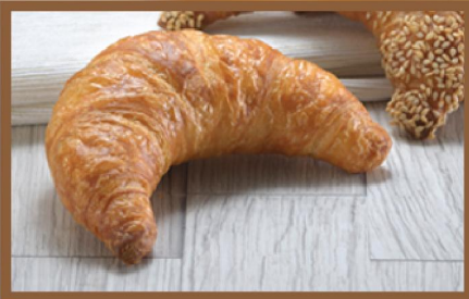
Butter Gipfel Crescent RM 3.50