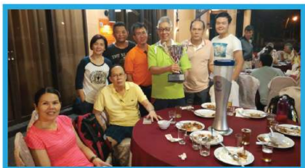
TABLE TENNIS ANNUAL CHAMPIONSHIP 2015

In spite of the good improvement of the players of the Sunway Lagoon and Royal Lake Club, our team managed to overcome both teams to retain the challenge trophy. We beat Sunway Lagoon with 11 games to nil and Royal Lake Club with 9 games to 2.