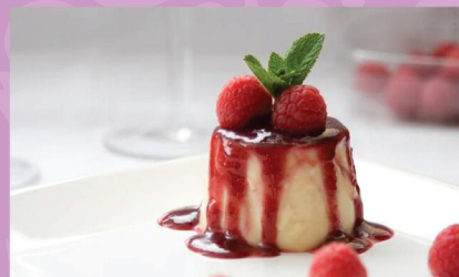
Dessert Of The Day

RM39 (Inclusive of GST) * Option:- * • Main Course only RM 33 • Dessert only RM12.80