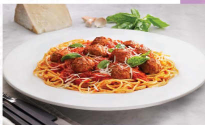
Spaghetinni Meat Balls