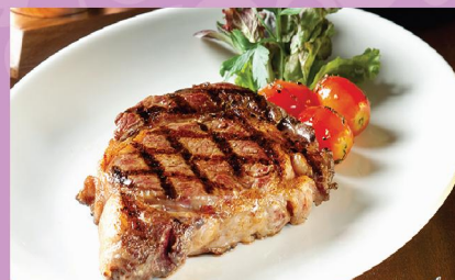
Grilled Australia Beef