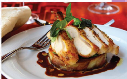
Provencale Herb Chicken