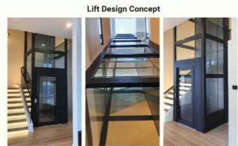
Image shown is for illustration purposes only. Final appearance may vary.

Expected Completion: 20 August 2026, subject to shipping schedules.