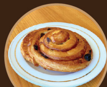
CUSTARD RAISIN DANISH