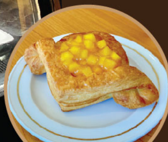
DIAMOND MANGO DANISH